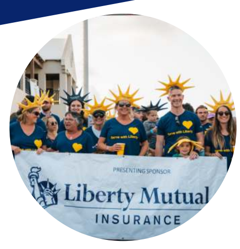
Relay For Life of Bermuda presented by Liberty Mutual of Bermuda 5,404+ people helped raise $833,792

Fundraising events are crucial to our mission, sustaining our vital work and ensuring our success. They raise awareness, engage new supporters, and provide opportunities for our community to actively contribute to our mission. These events also boost donations, offer unique experiences, and create valuable opportunities for ongoing engagement, helping us make a lasting impact in the fight against cancer.