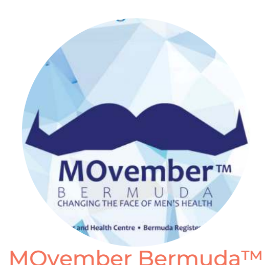
17 men + 5 teams helped raise $26,936